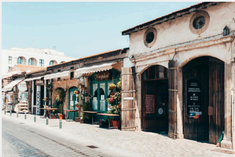
The city of Larnaca

TOWARDS THE CREATION OF POWERFUL LEARNING ENVIROMENTS,