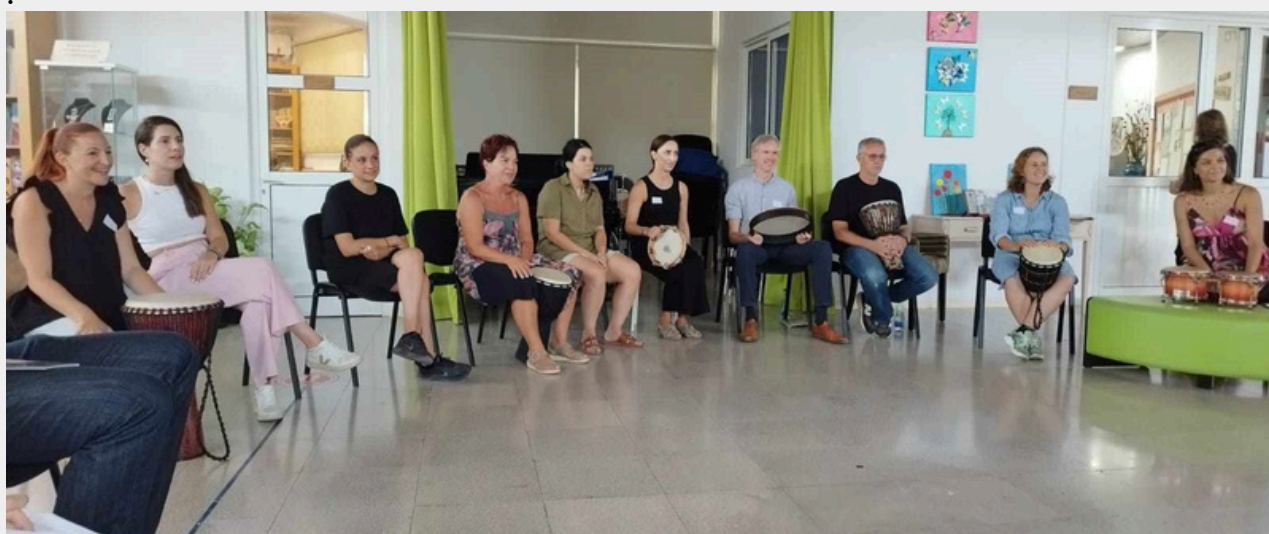
Fourth Transnational Meeting Larnaca, 05-06/09/2023: Study Visit

Our project partners also convened to strategize ways to amplify the project's impact and plan future dissemination activities. With unanimous enthusiasm, tasks were assigned, and the meeting concluded with a memorable group photograph—a testament to our shared dedication to making a difference. Stay tuned as we delve deeper into these topics, highlighting the innovative initiatives and collaborative efforts driving the mission of Saint Spiridonas Special School forward.